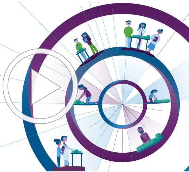
Healthcare Sim Week 2018

A celebration of global professionals who advocate for healthcare simulation in education, practice and research.