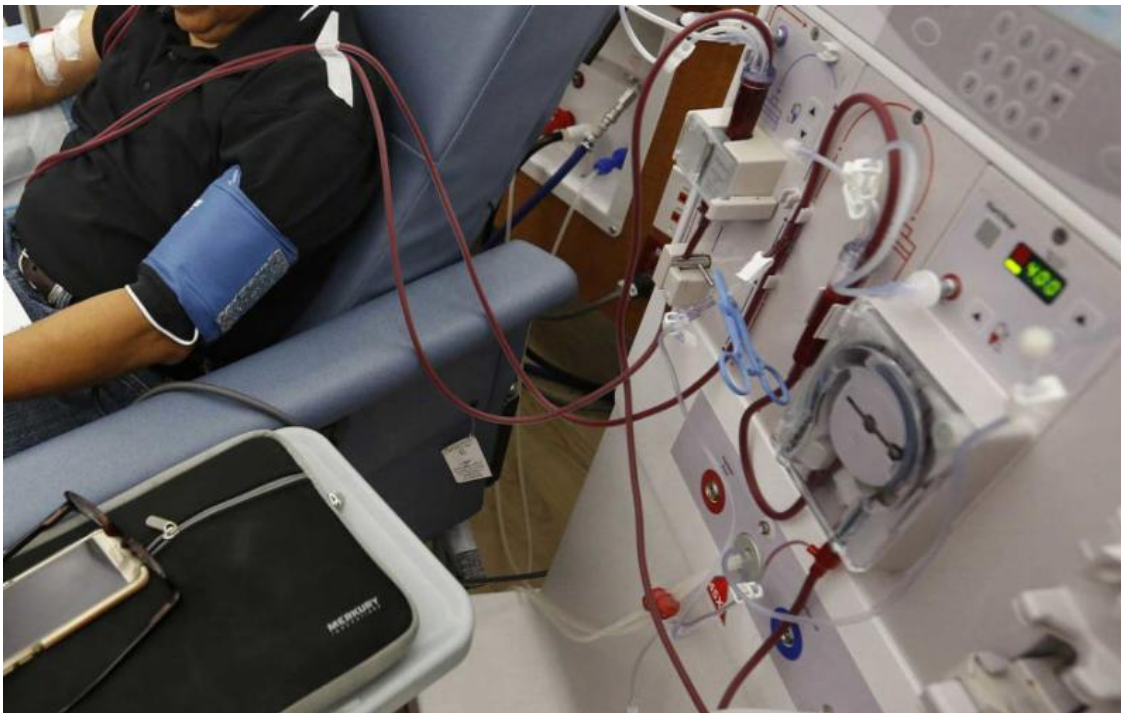
A patient undergoes dialysis at a clinic in Sacramento, California.